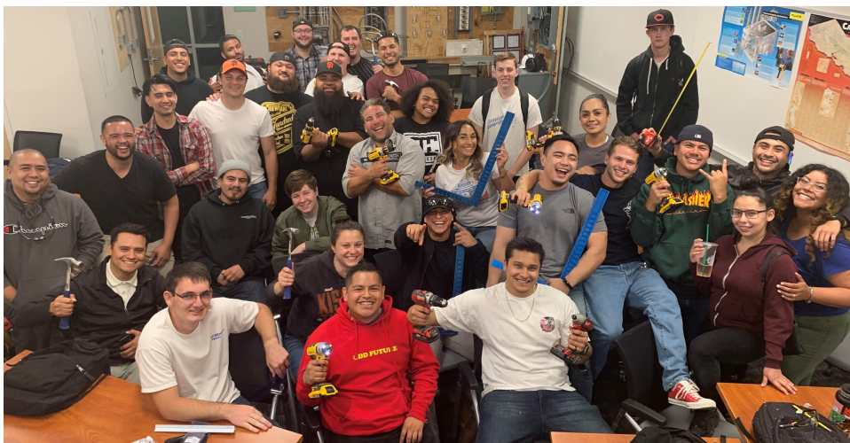
Pictured: 2019.1 TIP Graduating Class

This program is funded in part by: SB1/California Workforce Development Board, United Way Bay Area, San Mateo County Measure K, the Deloitte Foundation, and PG&E